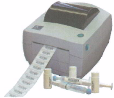
ITEM # TT-FLAG1 – FOLDED FLAG LABEL SAMPLE

Utilizing MPI's Thermal Transfer Label Printer (TTLP) and WinPak™ Barcode Labeling Software, MPI offers two convenient styles of Clear Stem Flag Labels to solve the Pharmacy's labeling needs for vials, ampoules, syringes and other items distributed from the pharmacy that require a bar code and label while meeting the specific needs of those who require the ability to view package content through the clear stem portion of the label.