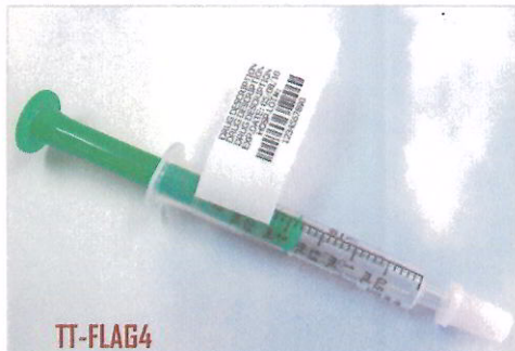
ITEM # TT-FLAG4 – STRAIGHT FLAG LABEL SAMPLE

MPI's Clear Stem Folded Flag Label solution has a combined print area of 1 1/2" x 1", providing a double-sided print area that allows both a bar code and 6-lines of text on an individual flag label.