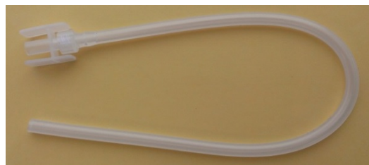
Tubing Set # SF-5701 (Standard)