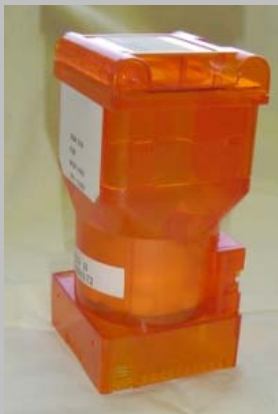
Requires use of canister shown. MPI does not provide canisters.

MPI's Auto-Print® with Auto-Print® Canister Feeder can be operated in CANISTER MODE and MANUAL MODE . In CANISTER MODE , a product canister is placed on the feeder and the feeder automatically feeds the oral solid medication one at a time until all medications have been packaged. In MANUAL MODE , the oral solid medication is placed on the plastic tray top and individually hand fed into the holes or slots of the feed disk.